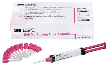
RelyX™ Luting Plus Automix – Trial Kit (3535TK)

Featuring an improved paste/paste formula with tack light-cure option, RelyX™ Luting Plus Cement offers better bond strength compared to other leading RMGI cements, while making clean-up fast and easy. Also available in the Clicker™ Dispenser.