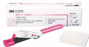
RelyX™ Luting Plus Clicker™ Dispenser – Trial Kit (3525TK)