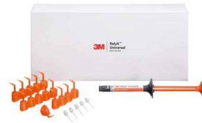
3M™ RelyX™ Universal Resin Cement Refill TR (56971)