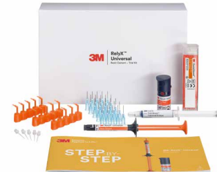
3M™ RelyX™ Universal Resin Cement Trial Kit TR (56969)

56976 15 x 3M™ RelyX™ Universal Micro Mixing Tips with Elongation Tips